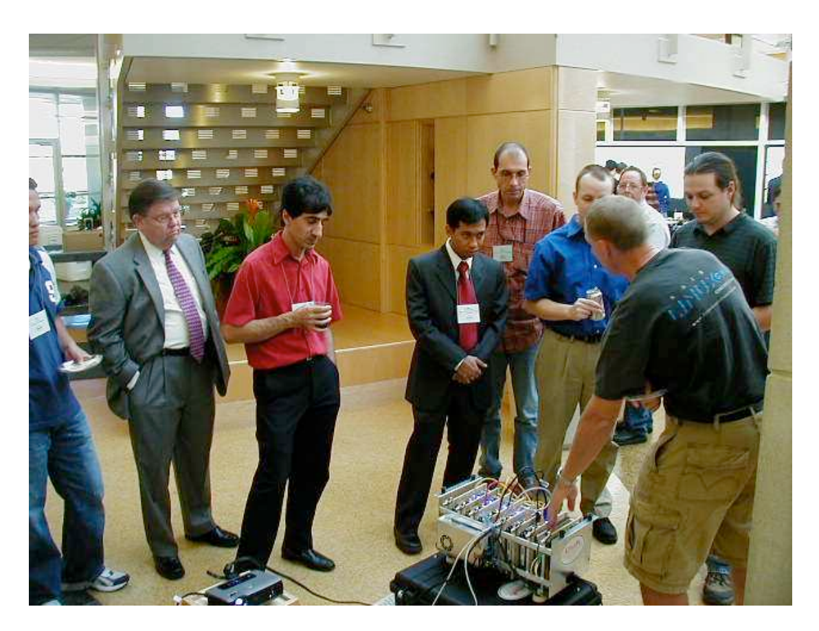
Figure 4.2: A demonstration of LittleFe at the Oklahoma Supercomputing Symposium in 2006.